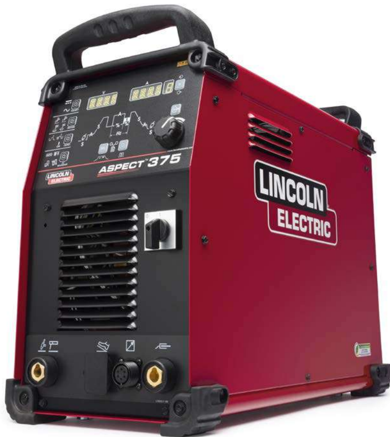
Base Model Shown (K3945-1)