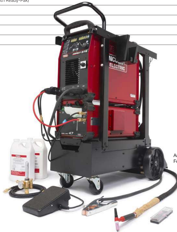
Aspect 375 Ready-Pak with Foot Amptrol™ Shown (K3946-2)