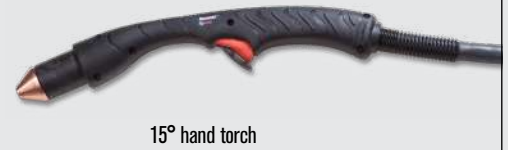
15° hand torch