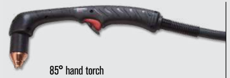
85° hand torch

Duramax® Hyamp™ standard torch styles (for more torch options, see www.hypertherm.com )