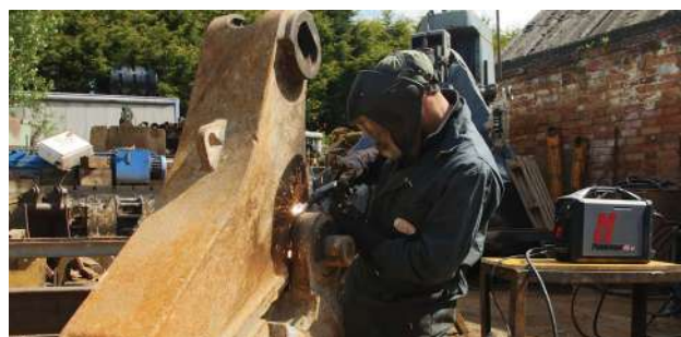
Maintenance and repair