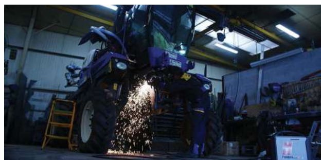
Agricultural and farm equipment maintenance